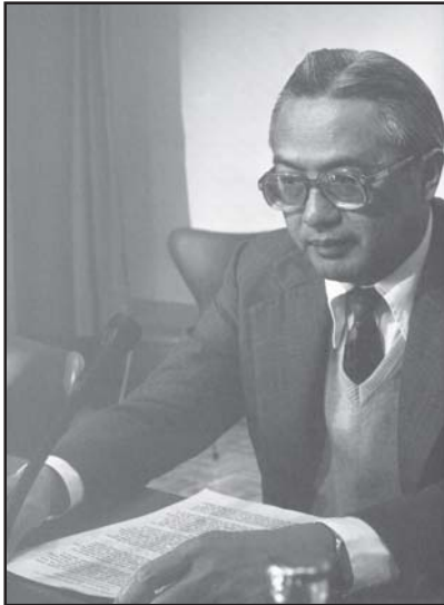
☞ Professor Prince Subhadradis Diskul was appointed as the Chairman of the Historical Commission, the Prime Minister Secretariat from December 19 th , 1985.